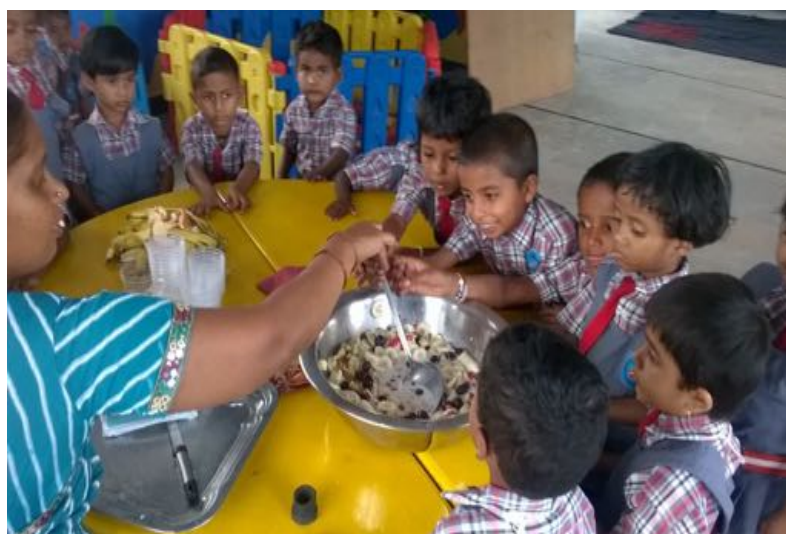
Illustration 3: Preparing a fruit salad, what fun!