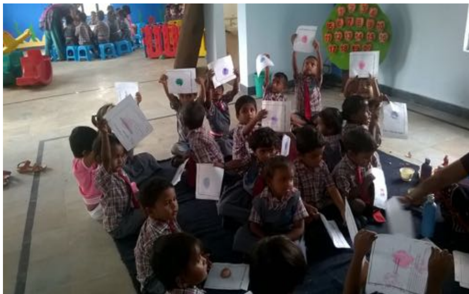
Illustration 1: Impressions