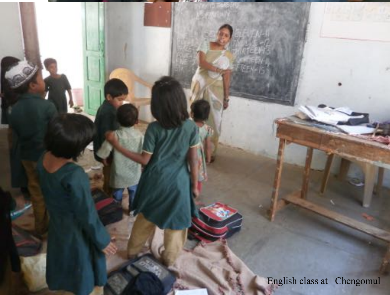
English class at Chengomul