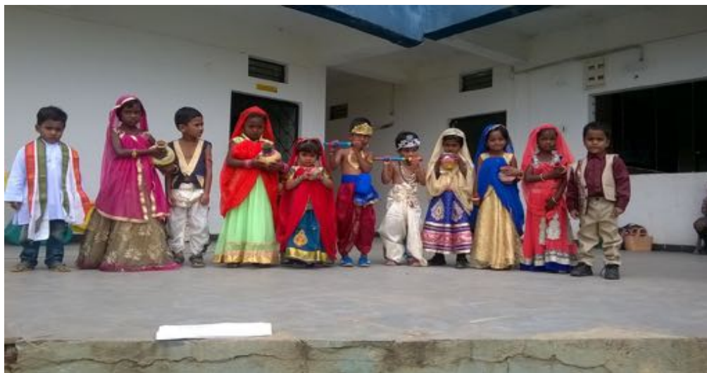
Illustration 2: Show performed by our little tots on the occasion of the republic Day.